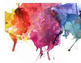
Art and Design