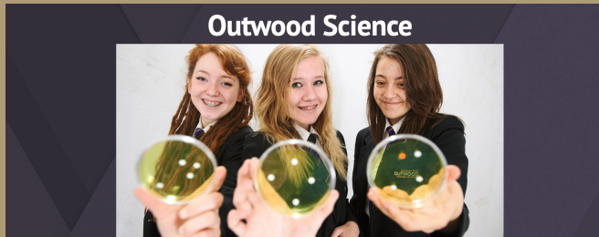
Outwood Science Revision Site