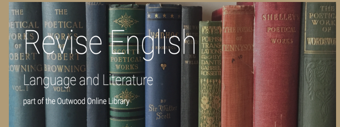
Outwood English Revision Site