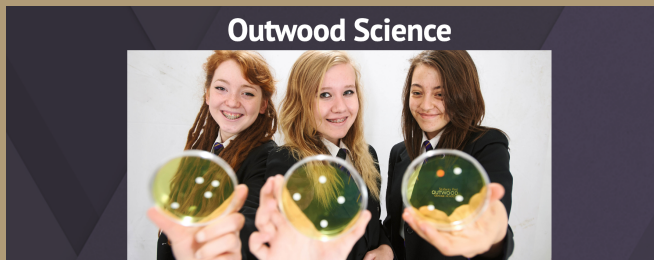
Outwood Science Revision Site