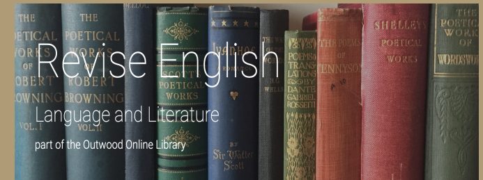
Outwood English Revision Site