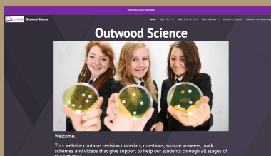
Outwood Science Revision Site